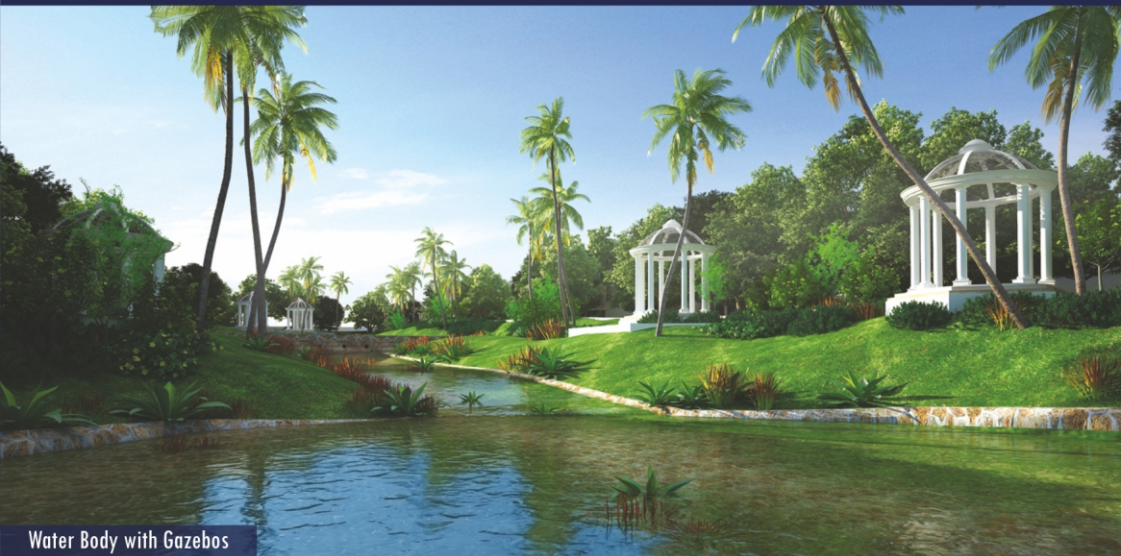
Water Body with Gazebos