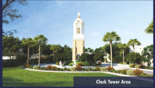
Clock Tower Area