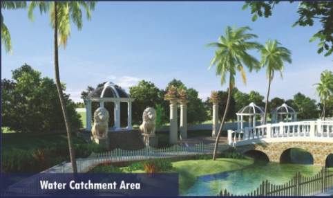
Water Catchment Area