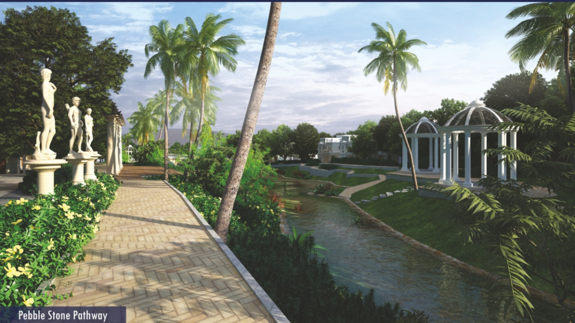
Pebble Stone Pathway