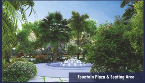
Fountain Plaza & Seating Area